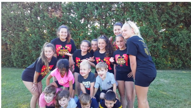
Members of the Shooting Stars Dance Troupe helped us find balance and move!

VBS 2018: Our Faith is Over the Top—Carnival Fun & Joyfilled Learning! Special thanks to all of our teachers and helpers. It was a great week for 20-30 children each night!